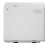
Paper Deck Unit (A3)